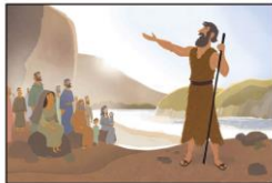
John the Baptist Told About Jesus